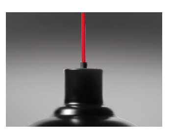
/RC Red braided cable