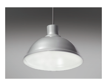
/G Grey satin outer, white satin inner