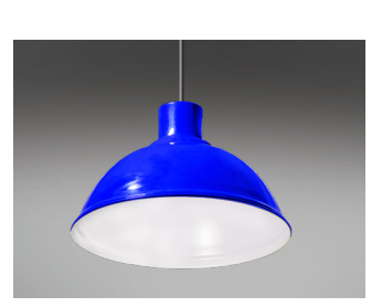
Product variations Other colours and specifications available on request