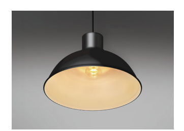
126.002 Warm dim (E27)