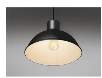
126.003 Dimmable (E27)