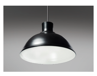
/B Black satin outer, white satin inner