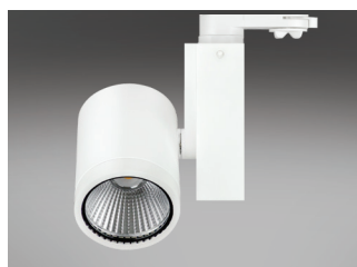
Vertical gear housing See 150 Series