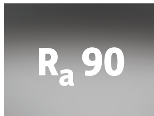
High colour rendering See technical