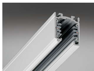
Track See Stucchi ONETRACK