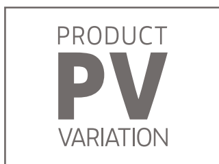
Product variations Other colours and specifications available on request