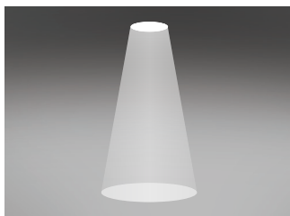
/NB Narrow beam reflector