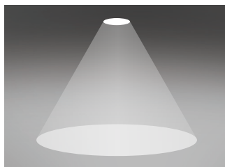
/WB Wide beam reflector