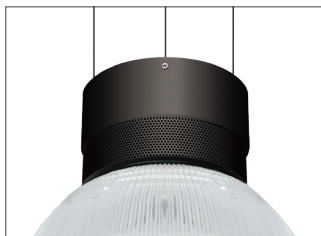
/BB Black, Black