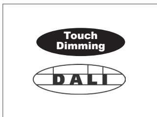
/T+DALI Touch dimming / DALI