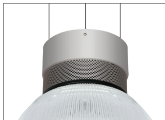
/GG Grey, Grey