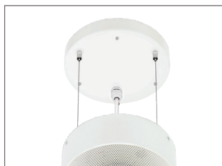
/5M 5 m suspension kit