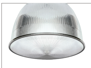
4700 Conical lens complete with clamp band