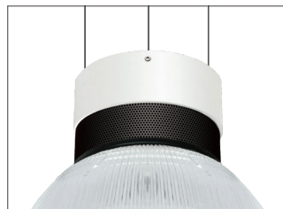
/WB White, Black