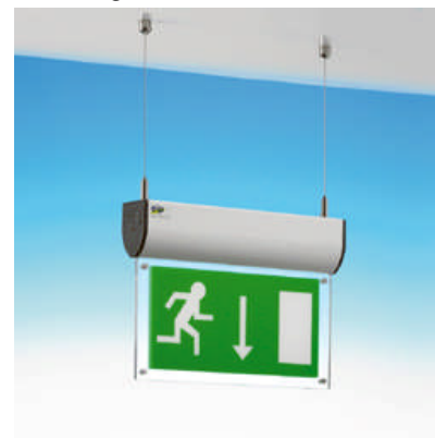
PHOTOGRAPH SHOWING THE RELATIVE SIZE OF SignalLED AGAINST A CONVENTIONAL HANGING BLADE SIGN

The suspended SignalLED luminaires are much smaller than conventional fluorescent hanging sign luminaires making installations more attractive but still providing 28metre viewing distance. All units are supplied with integral Maintained emergency lighting control gear powering 15 high brightness white LED's which clearly and evenly illuminate the safety sign legends. The range of mounting brackets allow fixing direct to the ceiling, wall fixing (parallel or perpendicular to the wall) or suspended solutions (surface, rod, wire or chain). In all cases the fixing brackets retain the standard luminaire body via quick release spring clips or two quarter turn latches.